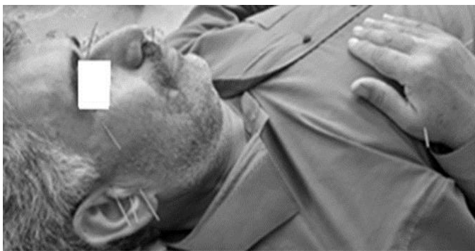
Figure 1: Needle insertion in acupuncture points suitable for treating tinnitus

Procedure: Based on previous studies, the acupuncture points suitable for treating tinnitus, including GB2, GB20, SJ21, SI19, SJ17, SJ3, SJ5, LI4, and SI6 points were selected, and the patients received 15 acupuncture sessions (3 times a week). Acupuncture was done by a skilled acupuncturist (B. N.) on specific points. Used needles, filiform or string types, were very delicate and flexible. The size of metal needles was 0.3×0.25 mm. Needles were placed vertically and without anesthesia at the desired points (fig 1).