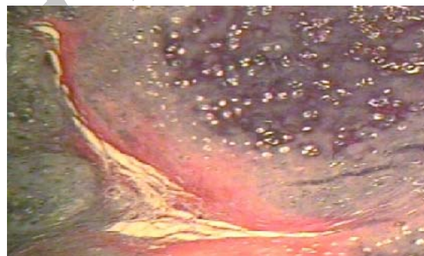
Figure 1. The lobulation pattern and fibrous tissue formation in enchondroma; the lobules are regular and the fibrous tissue is mature with low cellularity.

sections of all the samples were examined again. Two histologic patterns including tumor lobulation and fibrous tissue production around the lesions were used for making a distinction between well-differentiated chondrosarcoma and enchondroma. According to the histopathologic definition of the tumor, lobulation of enchondroma is regular and the lobules are the same size but well-differentiated chondrosarcoma is composed of different sizes of irregular lobules. Fibrous tissue formation around the tumor is the second most important pattern. The fibrous tissue around enchondroma consists of hyalinized mature connective tissue with few cellularity and little blood vessels. The tumor cells are inactive. In well-differentiated chondrosarcoma, the fibrous tissue around the tumor is cellular with active blasts and many blood vessels. 1-2 Figures 1 and 2 show the histopathologic pattern of lobulation and fibrous tissue formation in enchondroma and well-differentiated chondrosarcoma, respectively. Method efficacy was evaluated by tumor recurrence in a