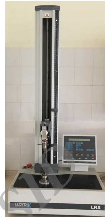
Figure 1. The push-out testing device.

The normality of data distribution was determined using Shapiro-Wilk test. Then the statistical differences between the groups were calculated using Kruskal-