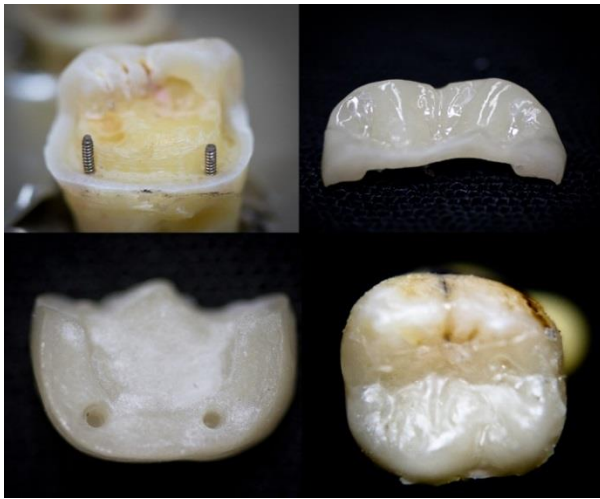
Figure 1. In vitro e.max press pinlay.