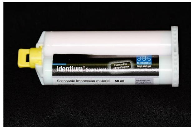
Figure 5. Identium light body impression material.

ada) (Figure 8). The triple tray was seated accordingly and the maxillary and mandibular teeth were brought into maximum intercuspation (Figure 9) following manufactures instructions for 2 minutes and 30 seconds.