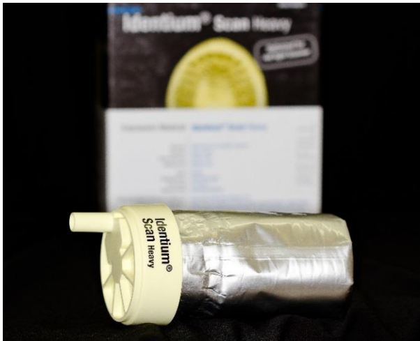
Figure 6. Identium heavy body impression material.