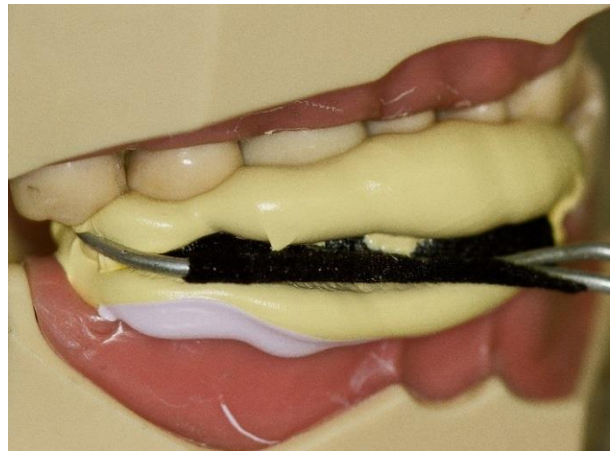
Figure 9. Triple impression technique.

The dentoform teeth were disengaged and the triple tray impression was removed. The sheaths facilitated the removal from the retentive pins. A standard paper clip was fabricated into an L shape and inserted into the sheaths (Figure 10). The impression was poured with Jade Stone (Whip Mix, Louisville, USA) and the