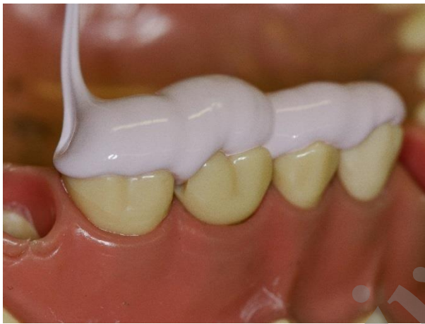
Figure 7. Light body dispensed onto onlay preparation.