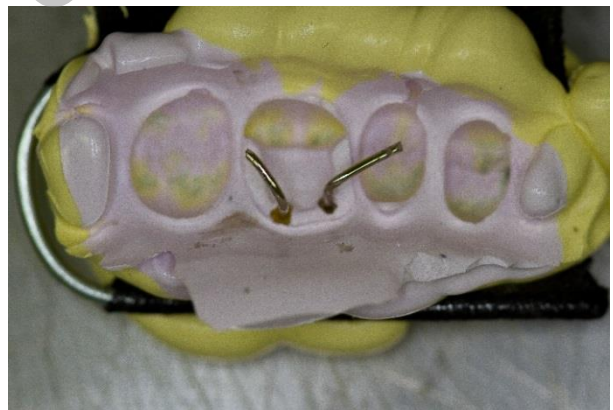
Figure 10. Paper clips placed into pin holes.

Template (Figure 12) (Clinician's Choice, New Milford, USA) and Temp tray (Figure 13) (Clinician's Choice, New Milford, USA) were utilized to create a provisional matrix prior to the pinlay preparation. The matrix was loaded with bisacryl temporary