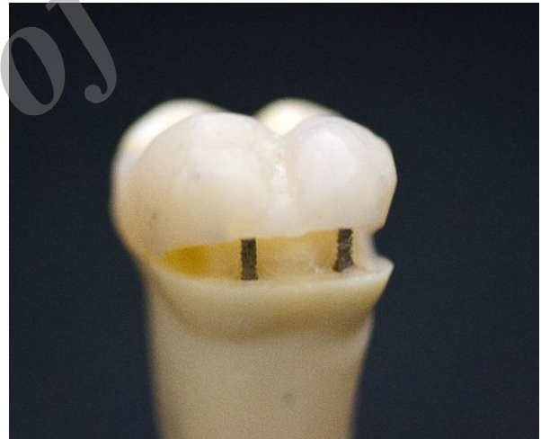
Figure 16. Provisional shaped, shaped and assessed.