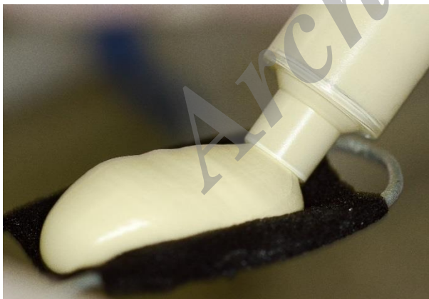
Figure 8. Heavy body dispensed onto triple tray.

The dentoform teeth were disengaged and the triple tray impression was removed. The sheaths facilitated the removal from the retentive pins. A standard paper clip was fabricated into an L shape and inserted into the sheaths (Figure 10). The impression was poured with Jade Stone (Whip Mix, Louisville, USA) and the