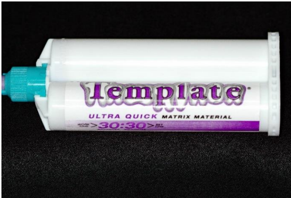
Figure 12. Provisional matrix material.

genol, polycarboxylate resin temporary cement (Clinician's Choice, New Milford, USA) was employed to cement the provisional onto the dentofrom pinlay preparation (Figure 17).