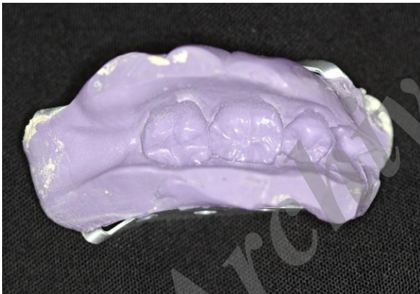
Figure 13. Provisional matrix.