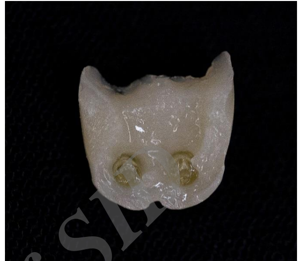
Figure 15. Provisional: internal aspect with sheaths.