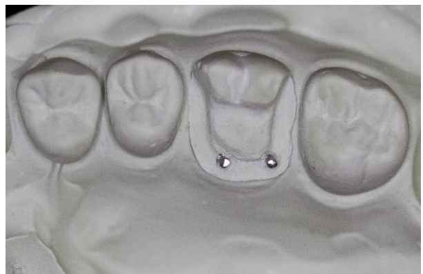
Figure 11. Master cast.