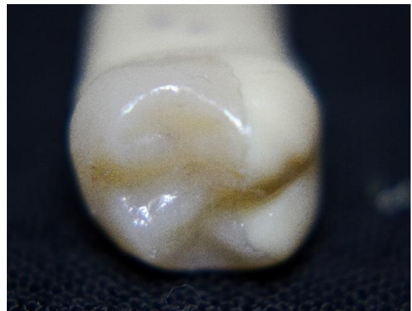
Figure 17. Provisional cemented onto pinlay.