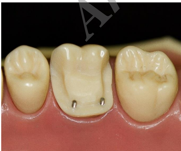
Figure 2. Onlay preparation on tooth #16 with 2 retentive pins

Vinylsiloxanether scan impression material (Kettenbach, Eschenburg, Germany) was used for the impression (Figures 5 and 6). The light body was dispensed onto the occlusal surfaces of the dentoform teeth (Figure 7) and the heavy body was dispensed on the triple tray (Tres Perfect: Research Driven, Kilworth, Can-