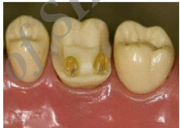
Figure 4. Retentive pin sheaths placed over pins.