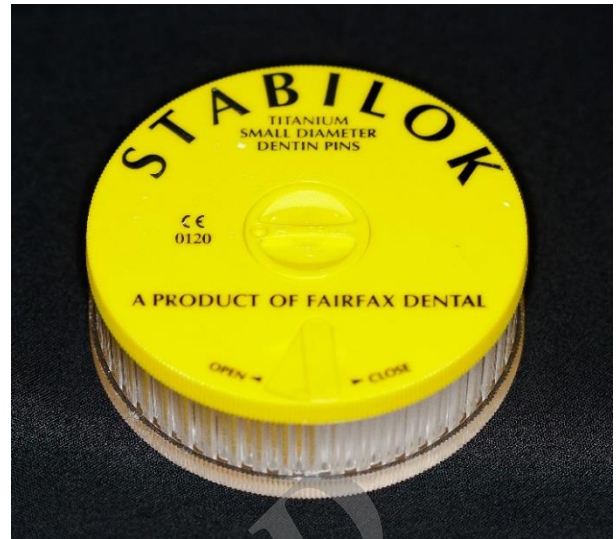
Figure 3. Stabilok retentive pins.