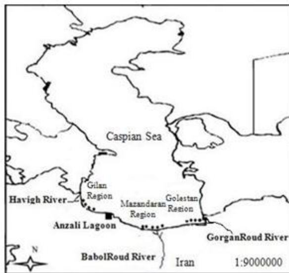
Figure 1: Map shows the sampling sites of Vimba vimba persa in the Iranian coastline

Iranian coastline of the Caspian Sea where this species migrates for spawning during spring (mid April to mid June), including 43 samples from Anzali Lagoon, 18 samples from Havigh River, 30 samples from BabolRoud River and 30 samples from GorganRoud River. The positions of these rivers are illustrated in Figure 1.