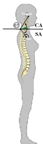
Figure 1. Cervical angle (CA) and Shoulder Angle (SA)

After uploading the images in the software, using a high precision pen with the ability to sense 1024 pressure levels, anatomical points, including C7, T12, ear tragus, and the midpoint of the shoulder joint were identified. Then, with the Kinovea software and photogrammetric technique, the images were processed. The cervical, shoulder, and thoracic flexion angles were measured individually. Kinovea is a reliable tool that generates valid data