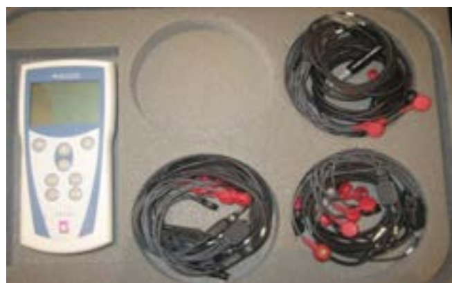
Figure 1. Electromyography recording device (ME6000 model, Mega electronic Ltd)

A total of 30 healthy females (Mean±SD=height: 164±6.4 cm, weight: 58.4±4.1 kg, age: 23.6±3.4 years) volunteered to participate in the present study. The subjects would be excluded from the study if they had any history of trauma or surgery or deformity in the lower extremity or any neurological disease. They had a normal range of motion and good muscle strength in the knee joint and they did not do any professional sports. The study was approved by the Iran University of Medical Sciences (IUMS).