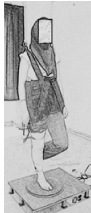
Figure 2. The rotational perturbation device and subject's position

First, the subject was perturbed with her knee in a straight position, and then in a bending position (Figure 2). Each subject was tested for four conditions and the order of conditions was randomized. The central nervous system prepares postural responses differently in anticipated compared to non-anticipated perturbations [18]. In this study, the subject did not know the exact time of perturbation. The rotational perturbation platform is made of a circular platform that has an engine embedded underneath.