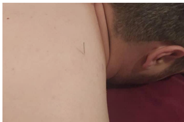
Figure 2. The procedure of dry needling the upper trapezius muscle

A sterile acupuncture needle with a diameter of 0.3 mm and a length of 5 cm was used for the DN application. The patient laid at a prone position in a way that the upper trapezius muscles were in a relaxed position. An