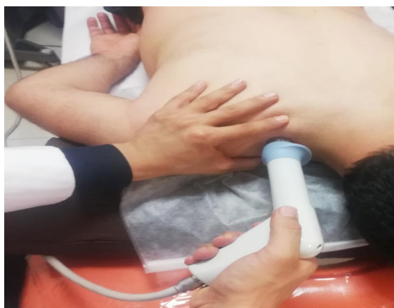
Figure 3. The procedure of upper trapezius muscle shock wave therapy