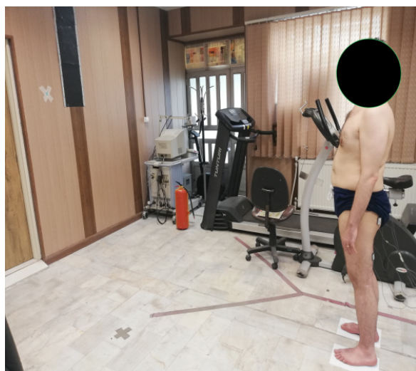
Figure 2. Standing position