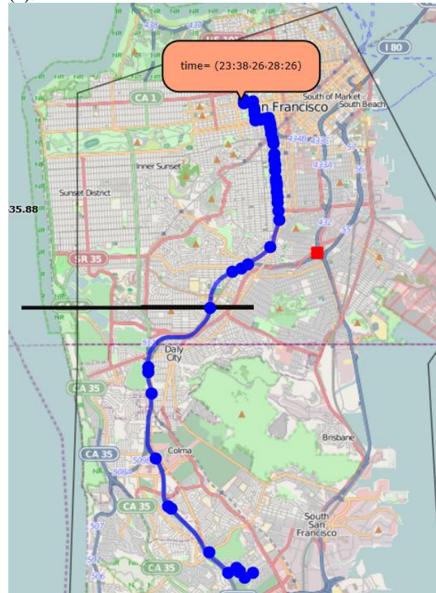
Figure (2): Routing is done by combining historical and real-time data

The result of implementation has been shown in the figure (2).