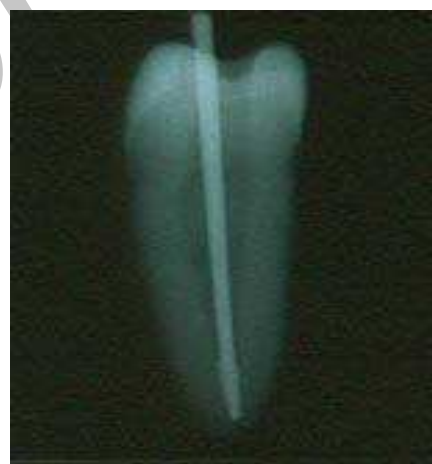
Figure 2. The heated gutta-percha master cone is interned and compressed in to the canal.