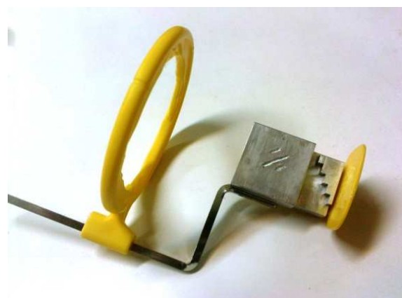
Figure 1. XCP with built-wedge steps.

provide different density on radiographs as a reference, the atomic number of aluminium is similar to the effective atomic number of bone. 29 By making the similar density of step wedge with computer software on consecutive radiographs similar density is provided on the background of all films and we can measure the difference in density around the implant during bone healing. For using the density-standardizing aluminium step wedge by XCP film holder a metallic device was made from aluminium and it was placed on XCP film holder between its metallic arm and plastic film holder. This device consist of a density-standardizing aluminium step wedge on an aluminium base plate and a upper plate of aluminium with some guide slots created on its surface for further establishment of bite register material and this plate is connected to the base plate by two lateral walls and the empty space between upper and base plates prevent superimposition of the dentition over step wedge image when the patient bite on the impression bite register material. In this way constant radiographic geometry and standard densitometry of radiographs was possible (Figure 1). Also, to provide the same geometric condition for consecutive radiography, impression material is required to be able to repeat the film's position in the patient's mouth constantly.