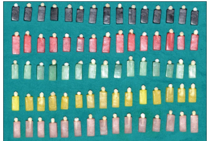
Figure 1: Premolar teeth mounted on acrylic blocks.

The force required to debond each bracket was registered in Newtons and converted into Megapascals as a ratio of Newton to surface area of the bracket base ( \text{MPa} = \text{N}/\text{mm}^2 ).