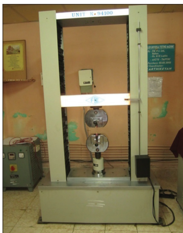
Figure 5: Instron universal testing machine.