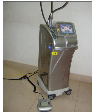
Figure 2: Erbium, chromium-doped: Yttrium scandium-gallium-garnet laser unit.