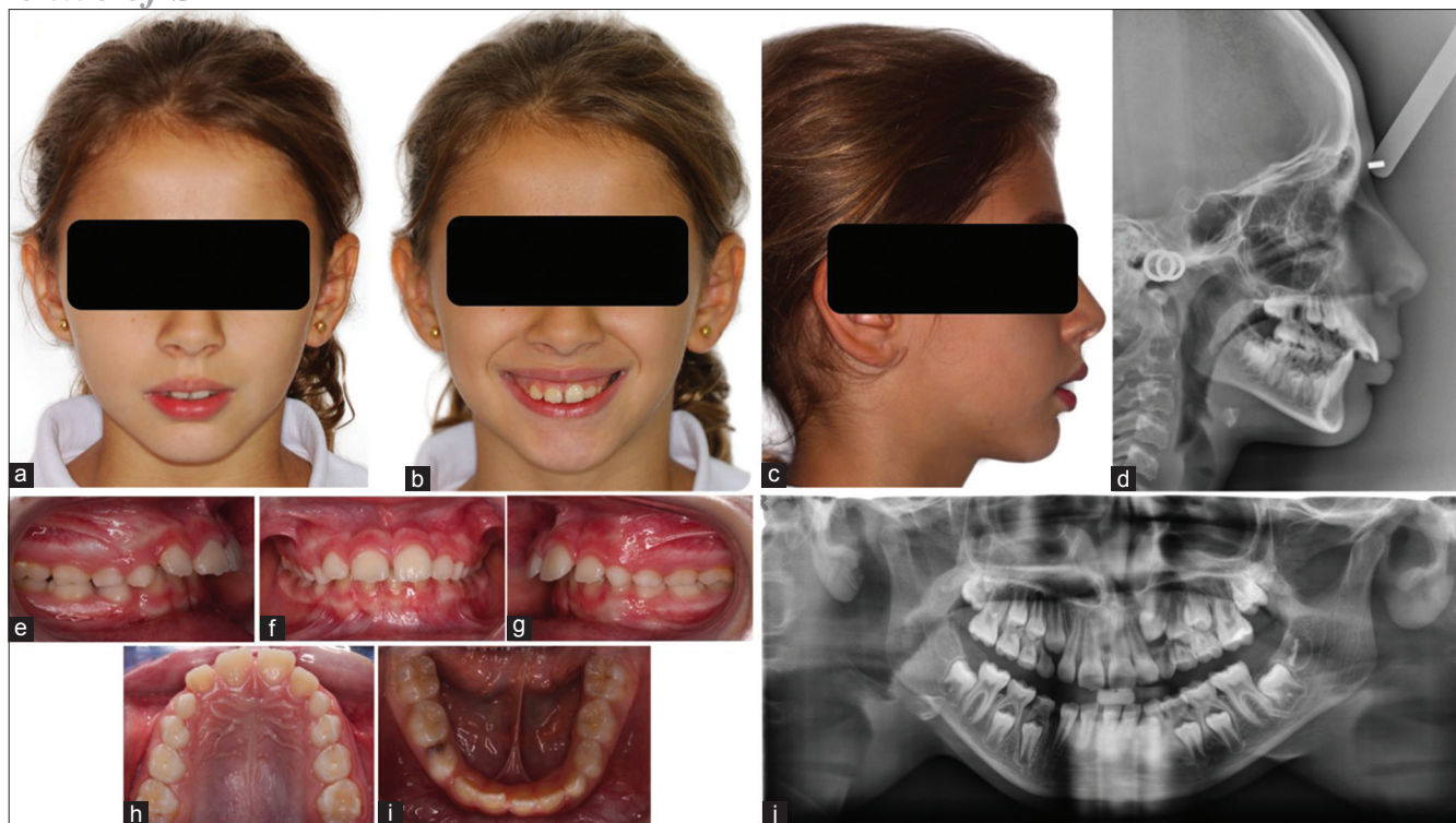
Figure 1: Clinical and radiographic records of the affected patient: (a) Facial-frontal view photograph at rest; (b) facial-frontal view photograph in smiling; (c) profile view photograph at rest; (d) lateral radiograph; (e) right buccal view in occlusion; (f) intraoral frontal view in occlusion; (g) left buccal view in occlusion; (h) upper occlusal view; (i) Lower occlusal view; (j) panoramic radiography.