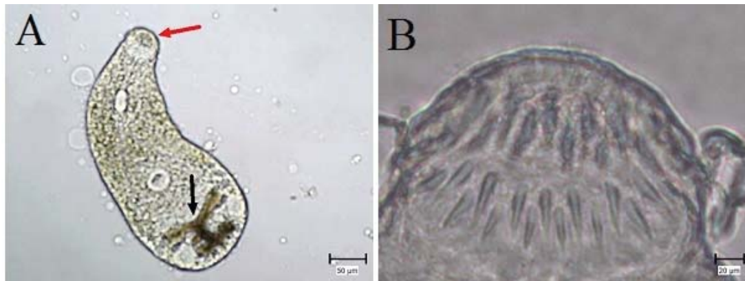
Figure 2 Wet mount of grass carp gill. Metacercariae of C. formosanus . A: Note the X-shaped excretory vesicles (black arrow) and oral sucker (red arrow). B: Spines are located in two rows.

mosanus causes morbidity and mortality in many wild and cultured fish [24]. The cercariae of C. formosanus are highly pathogenic to piscine hosts because they encyst in the gills and cause respiratory problems, however this trematode is not highly pathogenic in mammals, they can cause intestinal pain, diarrhea, and chronic enterocolitis in man, or death in experimental animals if heavily infected [11].