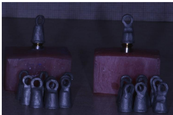
Fig 1. Mounting of implant analog and abutment into acrylic resin with castings constructed in two groups

Two layers of die spacer (Tru-fit, Jersey City, NJ) were painted over the abutment with 2mm distance from the margin.