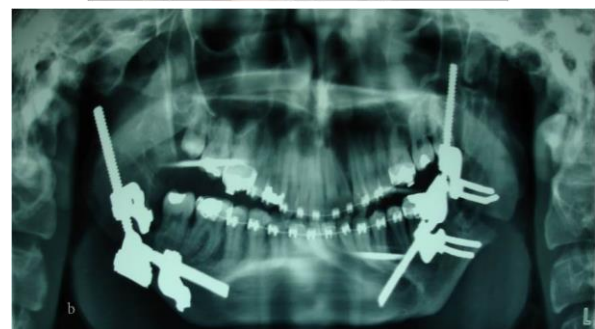
Fig. 2: The distraction osteogenesis (DO) procedure. (a) Left lateral view. (b) Panoramic view