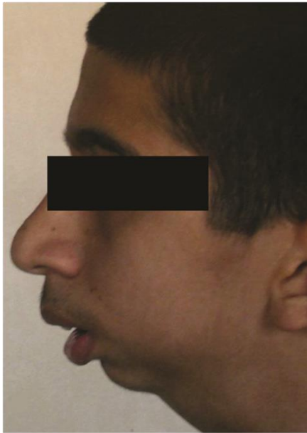
Fig. 1: Preoperative left lateral view

This condition is a serious challenge that poses technical difficulties during surgery, and it may recur [8]. Different surgical techniques can be used to correct the TMJ ankylosis such as mandibular advancement, genioplasty, distraction osteogenesis (DO) and orthognathic surgery [8].