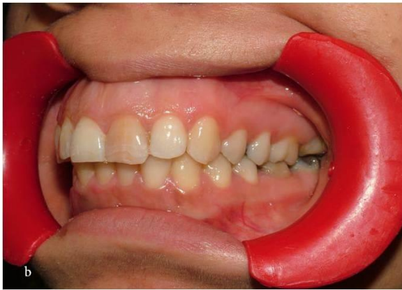
Fig. 4: Final result of the treatment. (a) Right lateral view. (b) Left lateral view of the corrected dental occlusion

After one month, we separated the Sh-device, and the mandible moved about 15 to 20mm forwards. The patient's breathing and sleeping improved. At the 8-year follow-up, the patient's profile was satisfactory. The patient's maximum incisal opening increased to 38mm (Fig. 4).