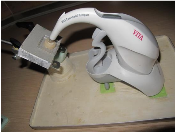
Fig. 3: Fixing the disc in front of the spectrophotometer by the fixing tool

For this purpose, wax and acrylic patterns with the shape and size of the desired discs were required. These discs had to be 12 mm in diameter and 0.6 mm in thickness (according to the manufacturer's instructions regarding the minimum required thickness). For the fabrication of these acrylic patterns, four metal stops measuring 3×3 mm with the thickness of 0.6 mm were fabricated to be placed between two glass slabs creating a 0.6-mm space. Next, according to the manufacturer's recommendations, a paste was prepared by mixing the monomer liquid and polymer powder (Pattern Resin; GC. Corp., Tokyo, Japan), which was placed between the two glass slabs. After complete setting, a 0.6-mm thick acrylic sheet was fabricated. For the fabrication of monolayer LT discs with the thickness of 1.2 mm, stops with the same thickness were used. Next, the discs with the same diameter were cut out of the acrylic sheet using a trephine bur (Biomet 3i, Palm Beach, FL, USA; Fig. 1). These discs were sprued and used as a pattern for the fabrication of ceramic cores. After casting, the discs were separated from the sprue using a separating disc (Ivoclar Vivadent, Schaan, Liechtenstein) and were then ground using the grinder discs recommended by the manufacturer. The thickness of the discs was adjusted using a digital caliper (Maxwell Digital