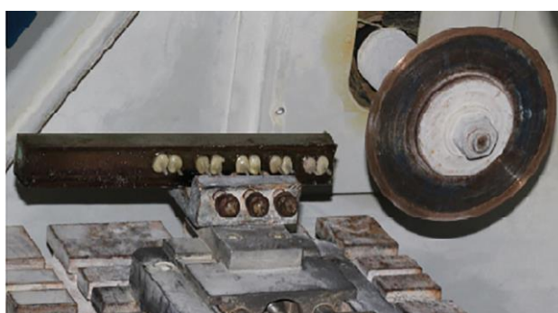
Fig. 2: Sectioning of the mounted samples

After setting, the resin block with the embedded roots was separated from the mold and placed in the cutting machine (Fig. 2).