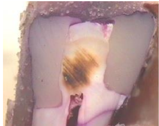
Fig. 1: Degree 3 of microleakage under the CEJ (left side of the image), and degree 1 of microleakage above the CEJ (right side of the image)

Figure 1 shows the sections of a restored tooth and the microleakage level.