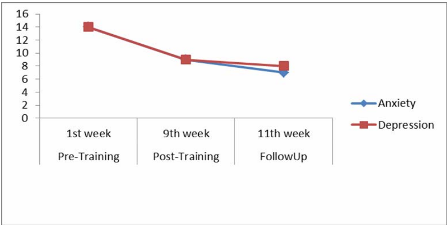
Fig 2. caregiver's depression and anxiety scores after the training program

In this case study, the primary aim was to investigate whether training transfer techniques can improve the musculoskeletal pain, depression, and anxiety of the caregiver. The results showed a decrease in pain severity for the caregiver through the training, post-training, and follow-up phases in comparison to baseline 1 and 2 results, and also a decrease in depression and anxiety level in the post training and follow-up assessments. Looking beyond the decrease in pain, depression, and anxiety scores, the caregiver reported significant changes across the phases. She improved from being reliant on pain relief medication at the start of this study to a person who no longer takes pain-related medicine. Moreover, by the end of this study, the patient was involved in transfer and the caregiver did not bear the entire workload. Our findings show promising results for training programs in improving pain severity, and, because of the link between chronic pain and its affective components (i.e. depression and anxiety), it consequently decreased depression and anxiety.