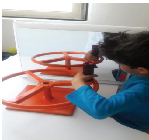
Iranian Rehabilitation Journal

Figure 1. Rotating the wheeling shoulder with non-affected hand in front of mirror