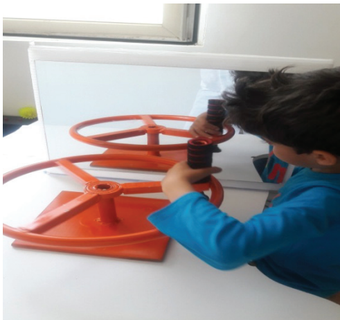
Iranian Rehabilitation Journal