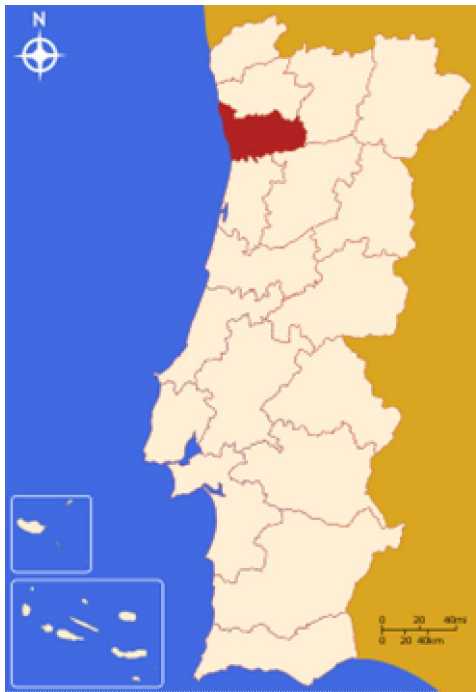
Fig 1. Location of the district of Porto