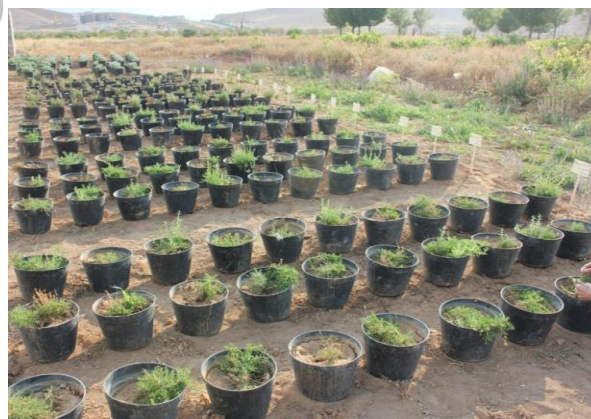
Fig 1. Experimental pots of two thyme species

Experimental treatments were arranged as a 3 × 2 factorial in a CRD with four replications. Factor A, irrigation levels included I 1 (irrigated in field capacity or control), I 2 (slight drought stress or irrigation in 75% field capacity when 75% of maximum total available soil water was depleted from before flowering until complete bloom), and I 3 (mild drought stress or irrigation in 50% field capacity when 50% of maximum total available soil water was depleted from before flowering until complete bloom). Two thyme species (Factor B) were T. daenensis and T. vulgaris .