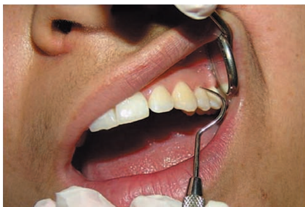
Figure 2. Dental sensitive surface stimulation by sharp probe

After the completion of these 3 tests in the examination, the teeth were randomly divided