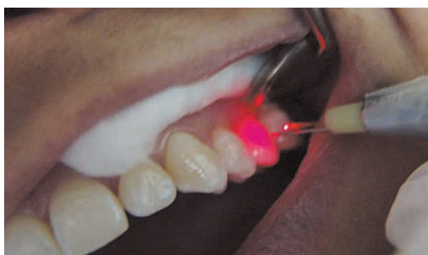
Figure 4. Nd:YAG laser irradiation on dental sensitive surface