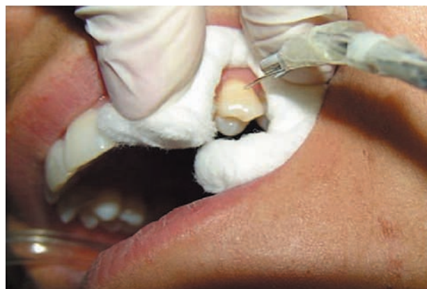
Figure 1. Dental sensitive surface stimulation by cold air blast