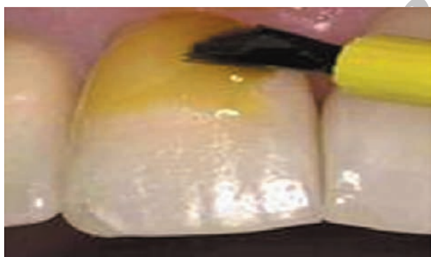
Figure 3. Fluoride varnish application on dental sensitive surface