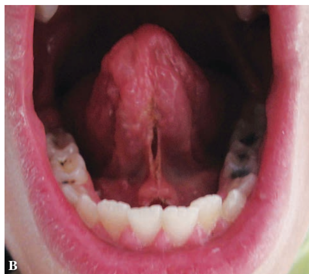
Figure 2A, B. Immediately after procedure