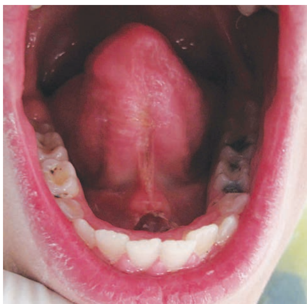
Figure 3. The follow up session after 7 days