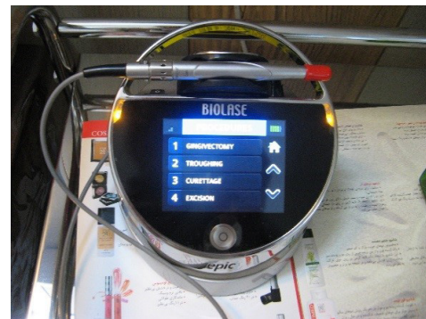
Figure 1. Biolase Epic™ 10 Diode Laser Device.