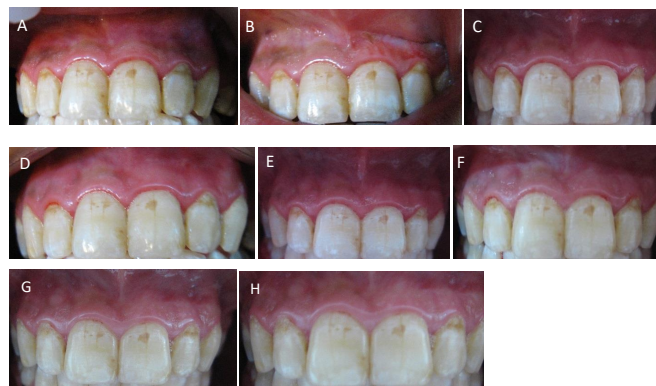
Figure 5. Follow Up Periods: (A) Pre-operative, (B) During the procedure (Laser on the left Quadrant; Cryosurgery on the Right Quadrant), (C) 1 week post-op (assessing wound healing), (D) 2 week post-op (assessing wound healing), (E) 1 month post-op, (F) 3 months post-op, (G) 6 months post-op, (H) 12 months post-op (No recurrence).

GPI had a significant difference between the 2 treatments over time so that laser had lesser GPI as compared to cryosurgery and the relationship between treatment and time was a continuous line, indicating no pigmentation recurrence during 12 months.