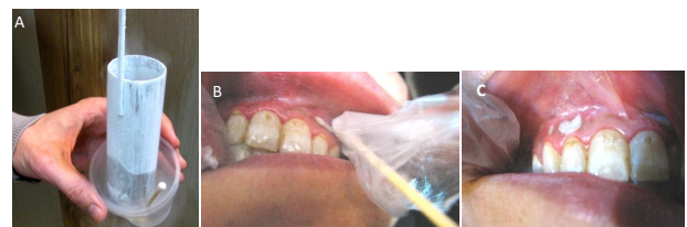
Figure 2. (A) Liquid Nitrogen Delivery Device, (B) Placement of Dipped Cotton Swab On Patient's Gingiva, (C) Liquid Nitrogen Stays on the Gingiva for a Few Seconds.