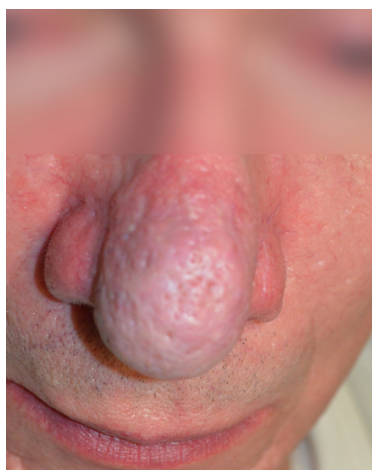
Figure 3. Stage 3. Four Months After 1 Session of Copper Vapor Laser Exposure \lambda = 578 nm, Power 0.8 W, Pulse Duration 0.2 s 1 Session.

very good, the quality of life fundamentally increased. No serious side effects were recorded.