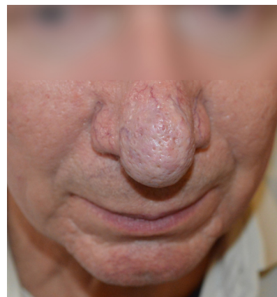
Figure 2. Stage 2. Two Months After 1 session of Copper Vapor Laser Exposure \lambda = 578 nm, power 1.2 W, Pulse Duration 0.2 Seconds.

4 months after the first laser procedure, the volume of neoplasm in the nasal area of the patient decreased in sizes by 2 times (due to the reduction in the number of vessels. The volume of connective tissue decreased, due to normalization of the lymph drainage the edema resolved), the color of the nasal skin became light, the cysts formed no longer, the sebaceous excretions have ceased (Figure 3). The patient regarded the result of the treatment as