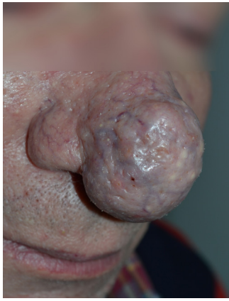
Figure 1. Male Patient 52 Years With Rhinophyma.

permanently inflamed. The excessive sebaceous excretion was observed. The patient felt a serious psychological dependence on the condition of the skin of the nose. He could not leave the house without a mask. The biopsy confirmed the diagnosis of rhinophyma. The patient was prescribed selective laser treatment of the total nasal skin area.