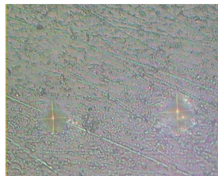
Figure 1. A View of the Effect of the Microhardness Test Indenter on the Enamel.

The means and standard deviations of microhardness of different study groups at various depths are presented in Table 1 and Figure 2 (group 1: control, group 2: saliva, group 3: MI Paste Plus, group 4: Er:YAG laser, group 5: Er:YAG laser plus MI Paste Plus).