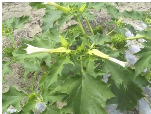
Figure 1. Datura Stramonium in blossoms

Datura Stramonium ( D. Stramonium ) is a weed from the family Solanaceae , the potato or nightshade family. The plant is native to Asia, but is also found in the West Indies, Canada, and the United States (Figure 1).