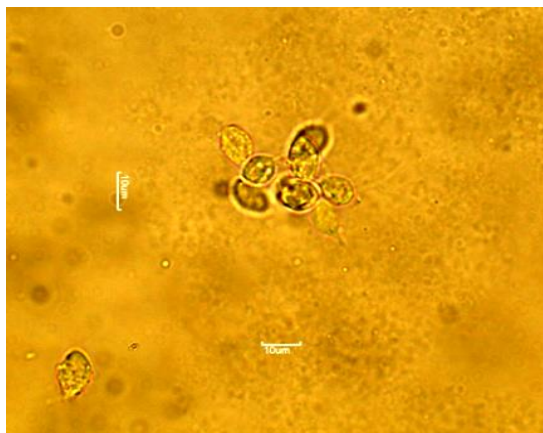
Figure 2. T. gallinae recovered from infected pigeons.