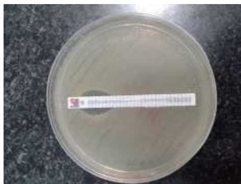
Figure 2- Determination of MIC by the E-test

According to results of the E-test, the minimum and maximum diameters of inhibition zone were 6 and 96 \mu\text{g/ml} for tobramycin, 8 and 96 \mu\text{g/ml} for gentamycin, and 12 and 96 \mu\text{g/ml} for amikacin (Figure 2).