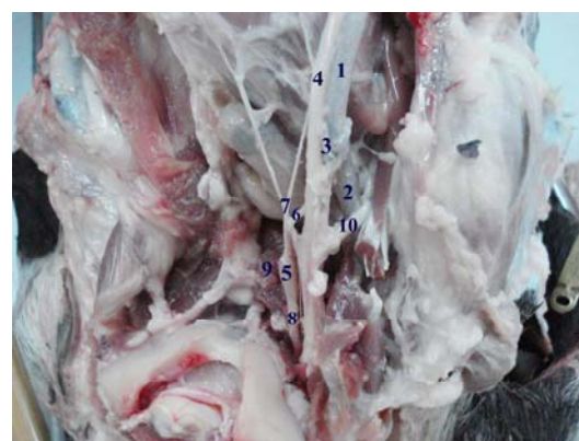
Fig. 2: 1. common carotid artery, 2. external carotid artery, 3. internal carotid artery, 4. vagal nerve, 5. cranial cervical ganglion, 6. external carotid nerve, 7. jugular nerve, 8. internal carotid nerve, 9. rectus capitis ventralis major muscle and 10. glossopharyngeal nerve