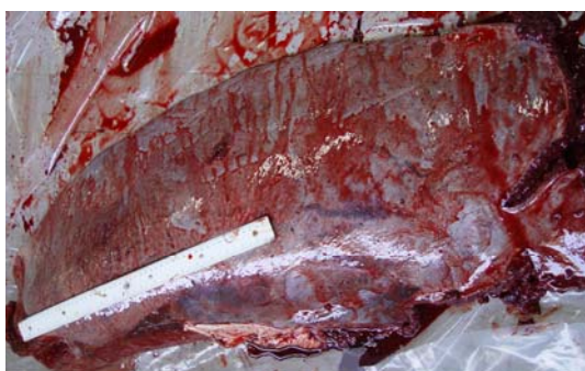
Fig. 1: Remarkable splenic enlargement led to fatal internal haemorrhage

Histopathological examination revealed extensive infiltration of medium to large sized lymphocytic and lymphoblastic cells with small amounts of cytoplasm, round nuclei with coarsely granular chromatin in the spleen (Fig. 2). There was diffuse infiltration of the red pulp with a dense population of neoplastic lymphoid cells resulted in the complete derangement of the normal architecture of the spleen. Infiltration of neoplastic lymphocytes was found in the sample of liver. There were approximately 1-2 mitoses per high power field. The histopathologic diagnosis was atypical malignant lymphoma.