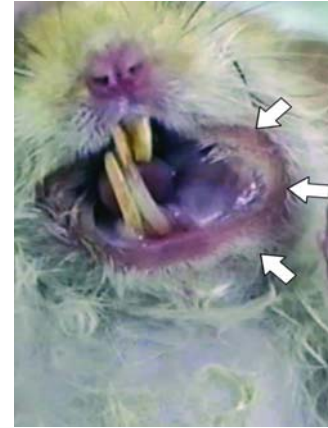
Fig. 1: Left facial enlargement resulted in malocclusion of incisors. (Arrows show tumor mass in the presented hamster)

In the presented case, facial swelling and salivation were the main clinical findings at admission. Several disorders such as impaction, abscess and tumors should be differentiated in these cases. Needle aspiration of swelling will differentiate between impaction and abscessation (Richardson, 2003). The incidence of spontaneous tumors in hamsters is relatively low. The majority of tumors are benign and frequently arise from the endocrine system or alimentary tract (Hrapkiewicz and Medina, 1998). Reports vary from 4% as an overall population incidence to 50% or more in hamsters over 2 years of age. Although spontaneous neoplasia is uncommon in hamsters, these animals are remarkably susceptible to a wide range of experimentally induced tumors. The hamster's eversible cheek pouch is relatively an immunologically protected site for tumor transplantation (Harkness and Wagner, 1989). Squamous cell carcinomas are relatively common in the oral mucosa of adult dogs and cats, but occur less frequently in other species (Carton and McGavin, 1995). Naturally occurred cheek pouch squamous cell carcinoma was only reported