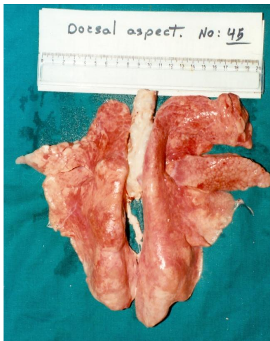
Fig. 1: Pulmonary adenomatosis, dorsal view of goat lung (enlarged, light grey, edematous). Affected by classical form of diaphragmatic, middle and apical lobes shows grayish-white nodules

abattoir survey in Fars province Khodakaram-Tafti and Razavi (2010) reported two forms of the disease occurrence of about 0.22%. The form of classical