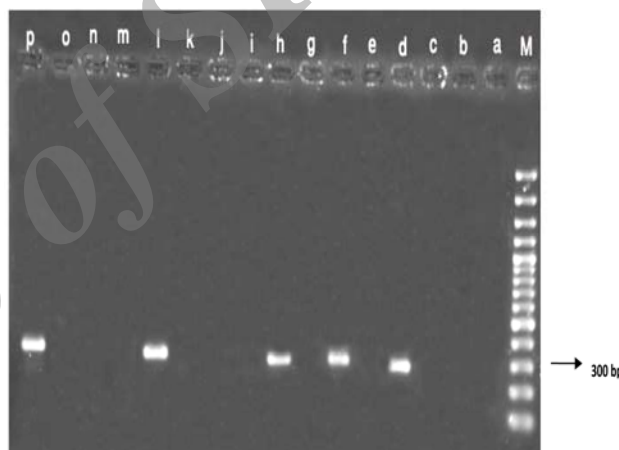
Fig. 2: Agarose gel stained with ethidium bromide showing nested PCR products. Lane M: Molecular size marker 100 bp DNA Ladder. Lane a: Negative control (without DNA), Lane p: Positive control ( L. bataviae ), Lane b, c, e, g, i, j, k, m, n, o: Negative samples, and Lane d, f, h, l: Positive samples