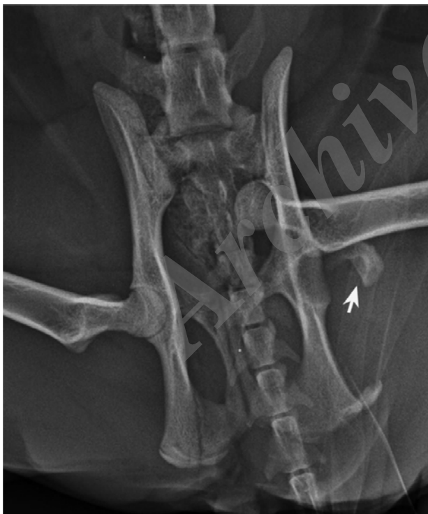
Fig. 2: Flexed ventrodorsal radiographic view of the pelvis of the same cat as in Figs. 1A-B. This projection detects the bone fragment of the left greater trochanter (arrow)

Therefore, surgical management of the left hip joint luxation was performed. After the open reduction through a craniodorsal approach, the toggle-pin fixation was attempted in order to stabilize the joint. A 2.0 mm hole was drilled from the fovea capitis through the