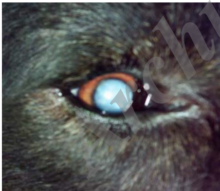
Fig. 1: View of mature cataract in the right eye