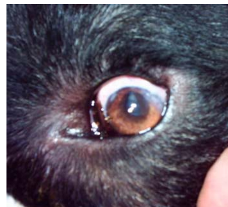
Fig. 4: Posterior synechia in the temporal part of the iris in the left eye 15 days after surgery