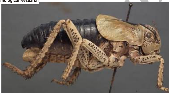
Fig 1- Callimenus latipes , lateral