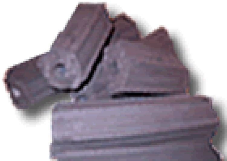
Figure 2 Sample of the sawdust charcoal briquette in a carbonized form.

(0.035 m × 0.035 m) with a concentric hole diameter of 0.01 m.