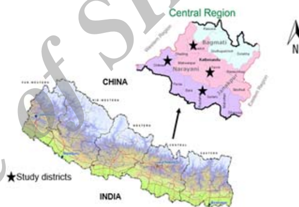
Figure 2: Map of Nepal showing study area

tude, is a landlocked country bordered with China in the north and India in the east, west and south (MOAD, 2011). Nepal covers a total area of 147,181 square kilometers. Topographically, Nepal is divided into three regions: the Himalaya to the north, the Hills in the middle and the Terai to the south. The study was conducted in four districts of Central Nepal namely Kavre, Nuwakot, Chitwan and Rautahat. These districts represent a wide range of agro-ecological variability and are located at an altitude of between 150 and 2500 meters above sea level. Out of eight districts, Kavre and Nuwakot were selected from the hill region; while Chitwan and Rautahat were selected from the tropical plain terai region that represents seven districts (Figure 2).