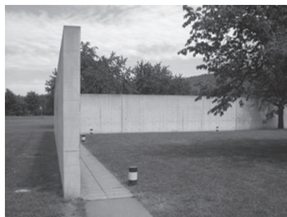
Fig. 4. Concrete walls to create enclosed domain, Seminar House, Weil am Rhein

In this sense, architecture creates an enclosed domain. The enclosed domain is actually a parallel action to the construction of place. To construct a place, it is necessary to delineate a distinct domain, an enclosure that denotes an interiority while preserving its links to the exterior. "Architecture ought to be seen as a closed, articulated domain that nevertheless maintains a distinct relationship with its surroundings" (Ando, 1990a, p. 457). Domains, as Norberg-Schulz (1979) shows, denote existential space and play an important role in "the language of architecture". Moreover, as Frampton argues, in the current ubiquitous placelessness of the modern environment, a "bounded domain" could propose a resistance against that dilemma, so that "the condition of 'dwelling' and hence ultimately of 'being' can only take place in a domain that is clearly bounded" (Frampton, 2002a, p. 85). This bounded domain prepares a true place, weakens general placelessness, and leads to critical regionalism.