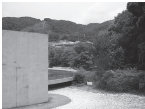
Fig. 1. Hierarchical approach to the Water Temple

The importance of movement for Ando can be seen in the way one approaches his buildings. Mainly in religious buildings, Ando avoids direct entry into the interior and presents a kind of hierarchical approach by using paths, pillars, walls, and colonnades (Fig. 1). This idea - like "perspectival perception" of Merleau-Ponty by which he acknowledges that perception is originally perspectival and there is no perspectiveless position - highlights the vital role of movement in perceiving the work of architecture and presents a "poetics of movement" as Plummer (2002) calls it.