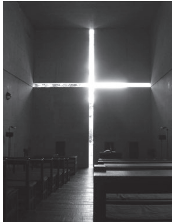
Fig. 3. Church of the Light

of the ever-changing character of light. Architecture, as the scene in which phenomena can be revealed, purifies light and brings it to our consciousness. Architecture helps light to be perceived as "Light", to show its character and capability.