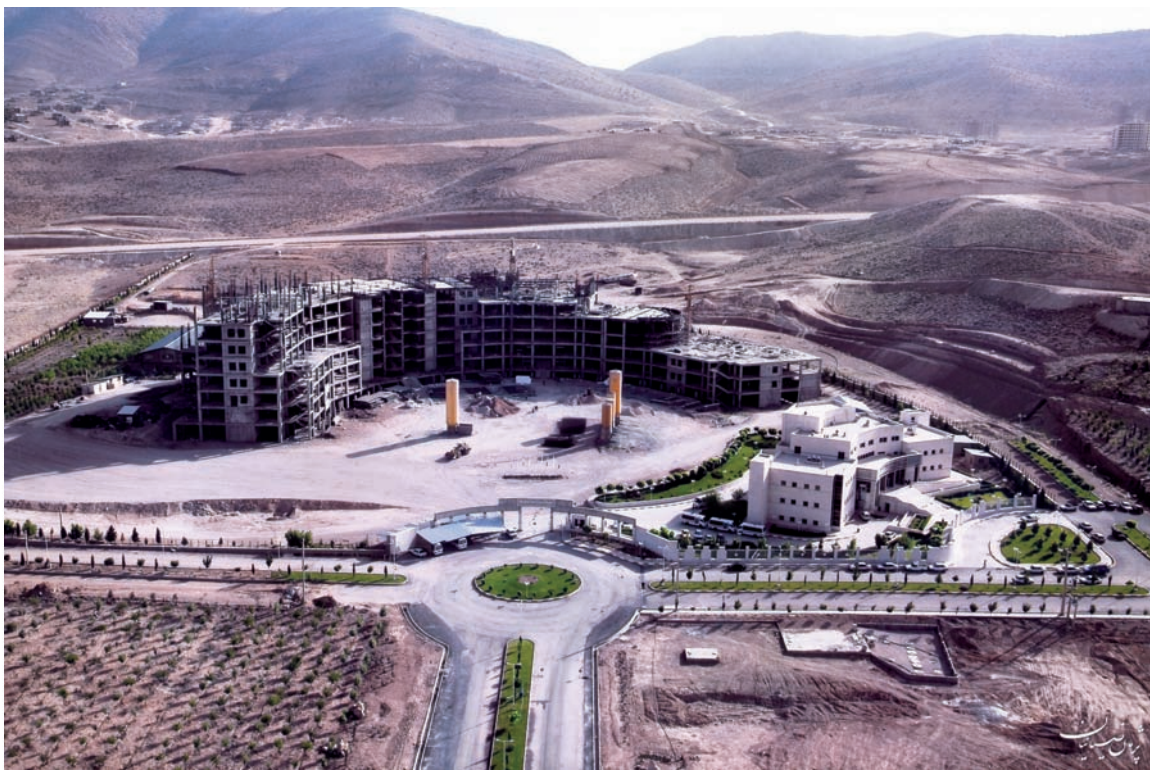
Avicenna Organ Transplant Institute under construction. Shiraz, southern Iran