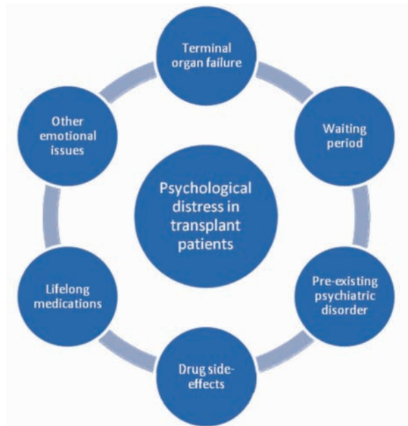
Figure 1: Factors in psychological distress in transplant patients.