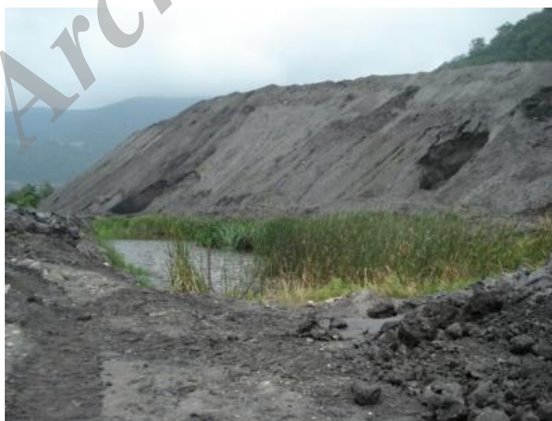
Figure 2. Accumulation of a large amount of waste in Zirab coal washing plant.