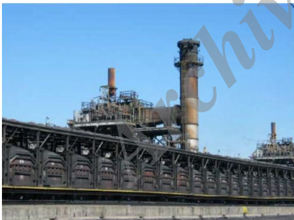
Figure 5. A view of sun-coke coke-making Company in Indiana, US [8].

This kind of coke-making oven is the newest one, a large number of which has been built in the USA. The most professional company that builds such ovens is the American sun-coke Co. In 1960, this company structured the first horizontal heat recovery oven, and then, later in 1970, presented a more modern model. In 1980, the company carried out investigations on the coke-making model to produce a more suitable coke in the USA. In 1990, the first coke-making unit was built in Indiana, USA. It was the first coke-making unit built worldwide based on the heat recovery method. Figure 5 presents a view of the sun-coke coke-making Co. in the Indiana city. Until 2008, the company built 562 ovens by this method in the Middletown and Haverhill states.