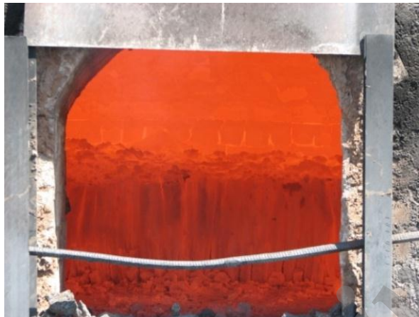
Figure2. Bee-hive oven ready to discharge [13].