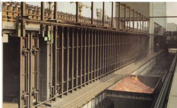
Figure 3. A view of a coke-making battery [15].

Figure 4 represents the coke production stages, and shows a view of a non-recovery oven activated by the vibro-compacting method.