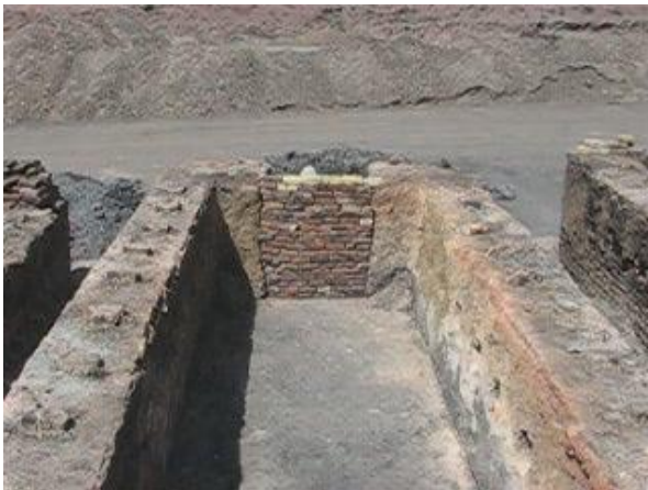
Figure1. A view of Mazghali oven ready to use [12].

Mazghali and bee-hive ovens is presented in Table 1 [13]. Figure 2 shows a Bee-hive oven.