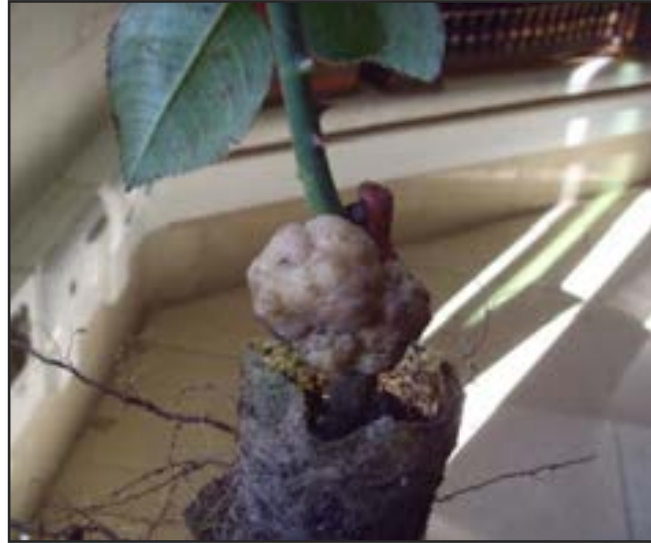
Fig.1. Gall samples in roses plants.