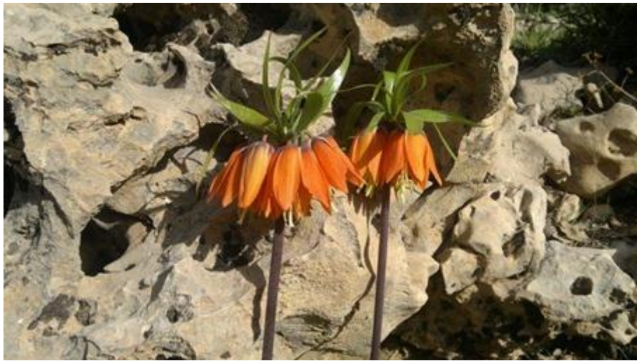
Fig. 3. Fritillaria imperialis in Ghalarang region of Ilam.

In this study, we used distance and quadrat method for investigation of the spatial patterns of Fritillaria imperialis where fixed-area sample plots were established and the number of points was counted within each plot. Based on quadrat count data, the sample variance/mean ratio was proposed as an index of dispersion, an index of random, uniform and clumped was developed, and the quadrat sampling method was focused on because of its better results comparing to distance sampling (Musaei Sanjerehei and Basiri., 2007).