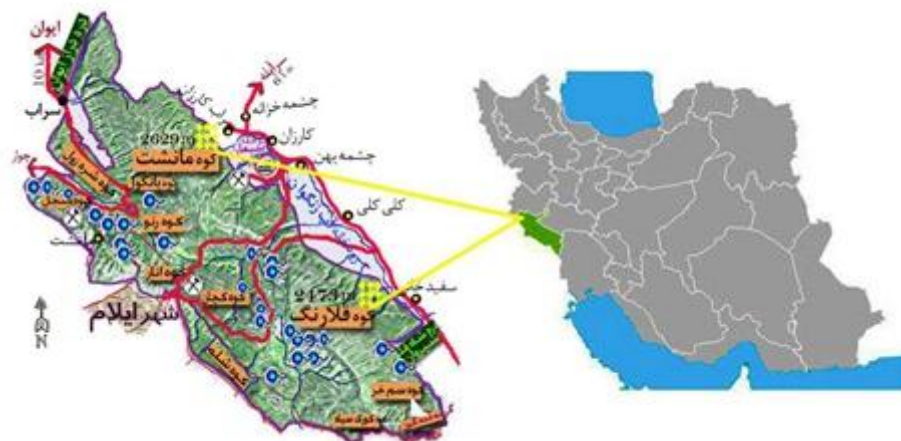
Fig. 2. Map of the study site in the Manesht and Ghalarang regions (the city of Ilam).

The present study was carried out in the Manesht and Ghalarang forest region with a 2,900 ha area located within a protected area in the northeast of Ilam province to the west of Iran in 2016. This region is situated between 46°20'56" and 46°27'37" East longitudes and 33°40'20" and 33°45'20" North latitudes. This region is limited with the Dalab River from the south, Manesht Mountains from the east, Bankul Mountains from the north, and Sharah Zool Mountains from the west (Fig. 1). The altitude in this region varies from 320 m in the north to 2,650 m in the west. According to available data from the nearest climatic station to the Manesht and Ghalarang woodlands, the mean annual rainfall is 630 mm, the mean maximum annual temperature of the warmest month is 26°C, the mean minimum annual temperature of the coldest month is 8°C, and the average relative humidity of the region is 47%. Surface soil with loamy clay texture is placed on a soil layer with heavy texture of gravel. Soil depth is relatively high and does not exceed one meter. Soil pH of this region is 7.5-8