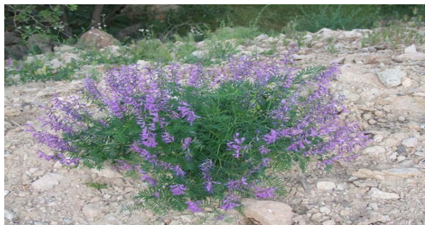
Figure 1 Vicia variabilis : photographed by H. Moazzeni, May 2010, Kohgiluyeh and Boyerahmad; Iran

store the species in spring to provide food for their animals during cold seasons. Vicia variabilis (Figure 1) is an annual, biennial or perennial, glabrous species (Fabaceae) with blue-violet elongate racemes that are longer than its leaves (Pakravan et al. 2000).