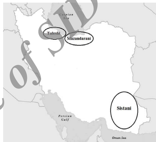
Figure 1 Geographic distribution of Iranian native breeds of cattle

They are kept for meat and milk production and are seen in all colors. The blood samples for this breed were collected from herds around the Mazandaran forests. Taleshi cattles are native to northern parts of Iran and are a dual-purpose breed, too. The blood samples for this breed were collected from two breeding stations in Guilan province. Sistani cattles, a humped breed belong to Bos indicus group are a type of domestic cattle located in the eastern region of Iran. These animals are a heavy built breed and used as dual-purpose cattle breed. One of the most distinctive features of Sistani cattle is its great capability to resist diseases which makes it a potential resource of germplasm useful for putative breeding programs. The blood samples of this breed for the current study were collected from the animals kept in the Zabol university farm (Figure 1).